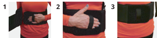
Snugging straps for large back panel