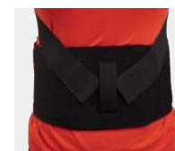
Optional belt extender panel