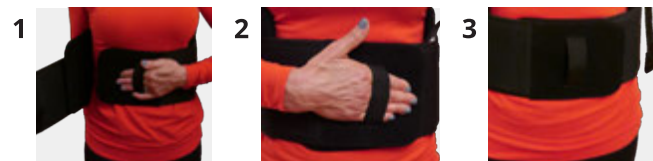
Snugging straps for large back panel